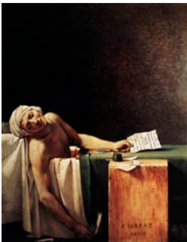
Death of Marat by David

Variations: there are many others - like 'clothesline,' 'zig zag,' and combinations thereof!