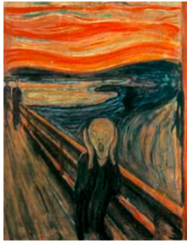
Edvard Munch, The Scream , 1893 Tempera on panel, 32 7/8 x 26 inches Munch Museum, Oslo