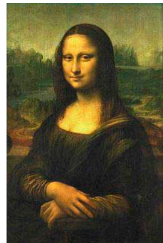
Mona Lisa by DaVinci