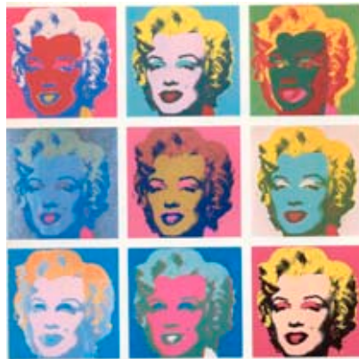
Marilyn - Andy Warhol - silk screen