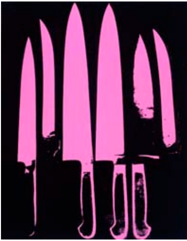
Knives , ca. 1981-82 acrylic and silkscreen ink on canvas 20 x 16 inches (51 x 41 cm.)