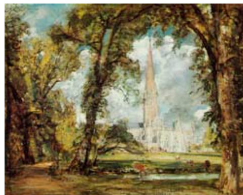
Constable - Salisbury Cathedral