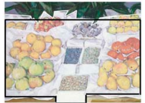
Fruit Displayed on a stand, Gustave Caillebote, c.1881-2 Oil on canvas, 30 1/8 x 39 5/8 in., Museum of Fine Arts, Boston

Variations: there are many others - like 'clothesline,' 'zig zag,' and combinations thereof!