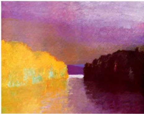
Lemon Squeeze - Wolf Kahn - 31 x 27 inches